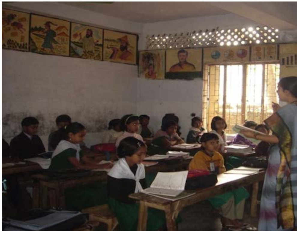
Figure 3: Rural Town School

Some of the class-rooms do not even have benches or desks (Fig. 2). There is no facility for drinking water in the school. This school has 10 teachers (6 male and 4 female) and the total number of students is 315 (in 2008).