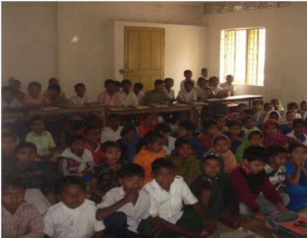
Figure 2: Rural School

This school is located in a poor community adjacent to a bazaar. The school has a building with separate classrooms. But the classrooms lack adequate facilities required for good study.