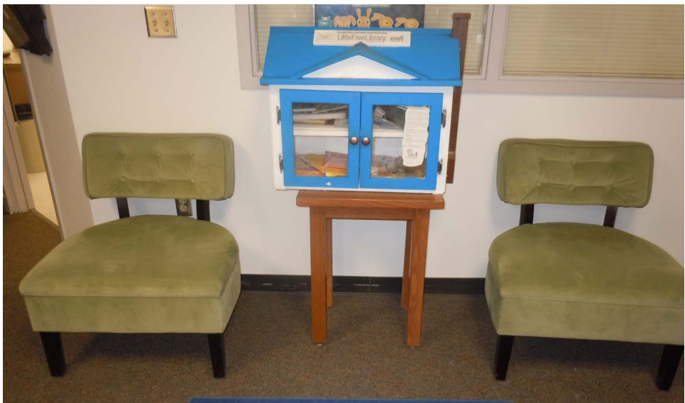
Figure 3. A welcoming space with seating and a Little Free Library are always a treat.