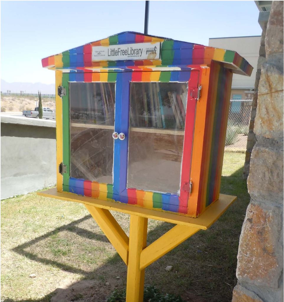
Figure 2. The Little Free Library welcomes patrons and prospective readers of all ages.

Even before I enter the school, the outdoor Little Free Library is alive with movement and conversation between students and their parents. A book talk is occurring en vivo , in real life. The Little Free Library consists of a wooden box full of donated and exchanged books. The library circulates on the honor code regardless of the book borrower's zip code and income level.