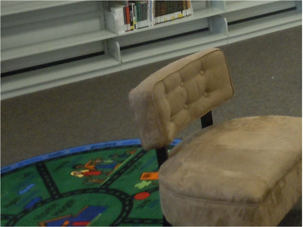
Figure 5. Seats are always available to the next bilingual reader in formation.

The students become storytellers and practice literacies through plays. For example, the story of Hansel and Gretel is appealing to them, especially the style of the cautionary tale that appears in Latin American storytelling. I was pleased to experience that students knew the story plots to tell stories. We all learned about their familiarity with storytelling and their interests in the performing arts.