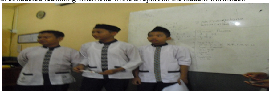
Figure 3. Students present their discussion

From figure 2, it is seen that the students work in group solving problems in LAS. In these activities, based on the observation, the students made observations, experiments, asked among friends and teacher. In addition, the students conducted reasoning when s/he wrote a report on the student worksheet.