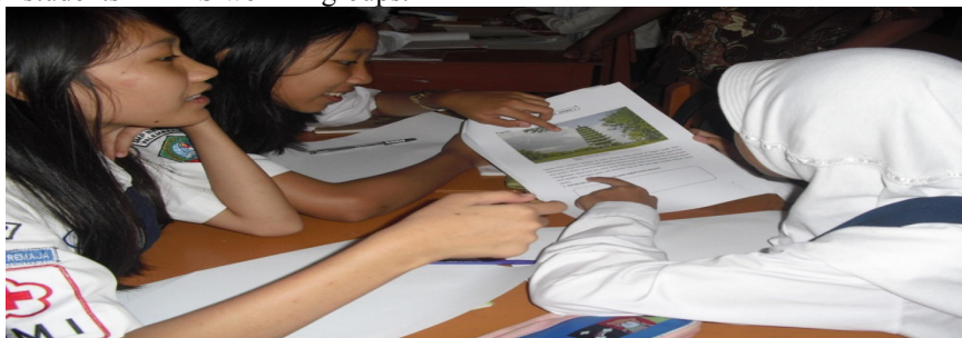
Figure 2. Students were observing the Prang in the picture

In accordance with the research objectives, the teaching materials developed have potential effects on the scientific activities of students in the learning process. Highly visible activity is the activity of observation, reasoning, ask questions, and try to do the working group in Student Activity Sheet (LAS). The following photos show the activities of students in LAS work in groups.