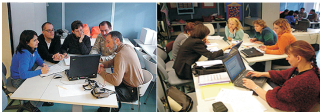
Figure 3. The ICE-ED Group Setting up their On-Line CSCL Activities

To utilize the BSCW managed learning environment participants just need general computer equipments such