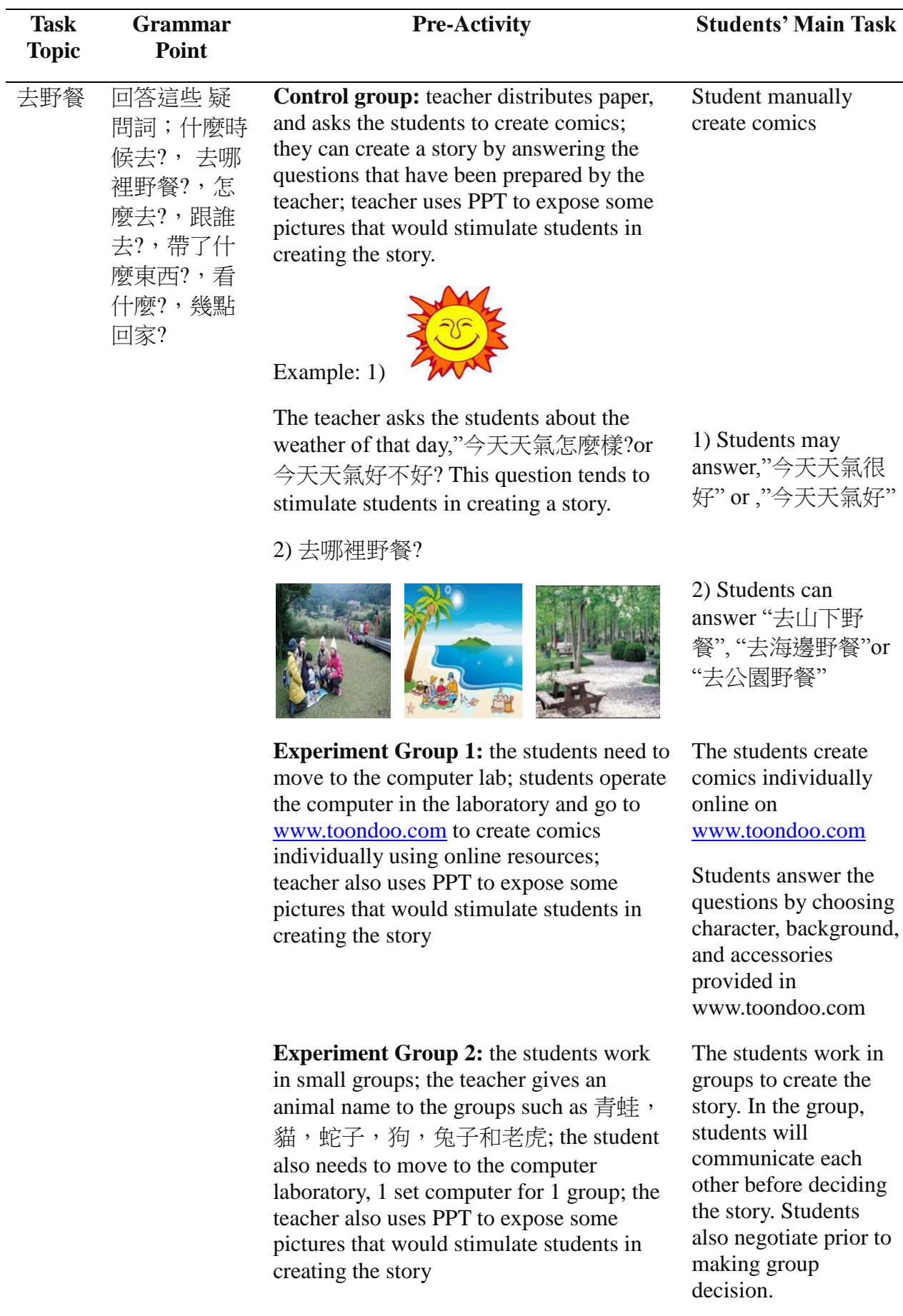
Table 4. Comic Lesson Plan