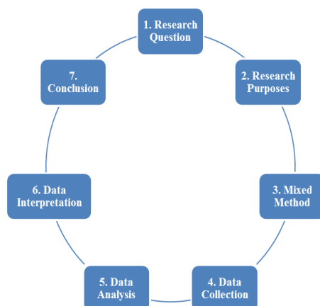
Figure 2. Mixed Research Model

To obtain both qualitative and quantitative data, the mixed method has been applied in this research. Figure2 shows the cycles about this mixed method in collecting data.