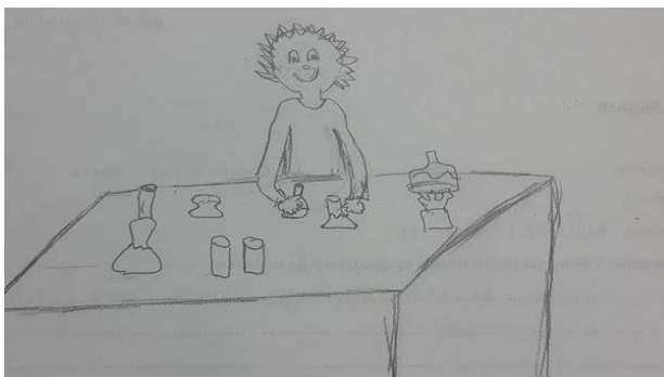
Figure 2 Common scientist with different lab equipment

included 17 types of equipment for both groups. However, the differences in frequencies of this same equipment in the two different drawings were clear. They drew these common types of equipment more frequently in their common scientist drawings than those for the scientists from a similar culture. As an example, figure 2 represents a common scientist with lab equipment.