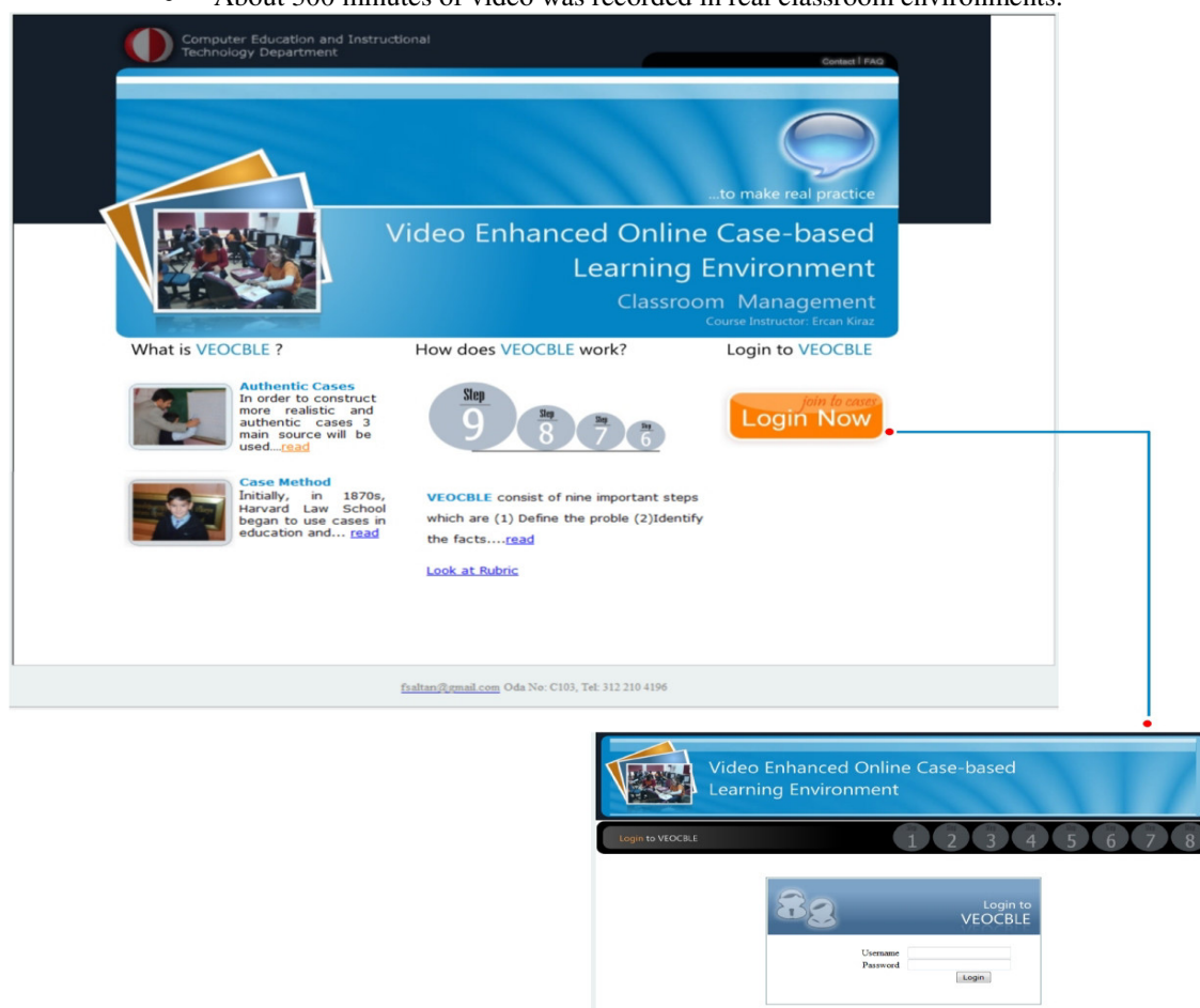
Figure 2. VOCABLE website.

Although the Plan phase was very long, the Act phase took only two weeks. Each week, students analyzed one case. During both weeks, the researcher and students had some technical problems. Moreover, it was seen that some parts of the first version of VOCABLE did not work effectively and some steps and scaffolds needed revisions. Therefore, at the end of the two weeks, the project proceeded to the Observe and Reflect phase. At this stage, which took one week, the researcher gathered data and analyzed them in a qualitative way.