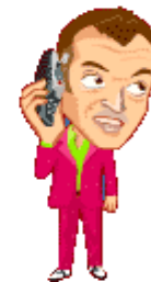
Figure 1: Example of Skinker and information box

After launching with Sky Sports for the West Indies cricket tour in April 2002 the company experienced considerable success and has around 30 clients including Halifax, Vodafone, Arsenal football team, Channel 4, Centrica, Warner Village and The Independent newspaper. The clients can deliver information on products or remind people of upcoming events; they can deliver training packages in manageable chunks or gather information on user preferences and feedback. The user can