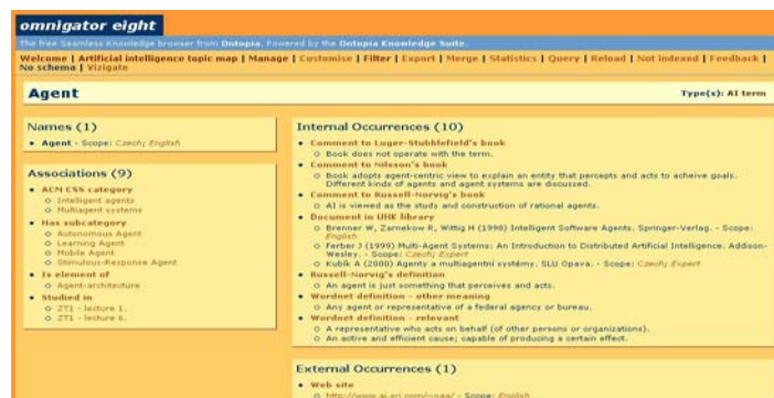
Figure 3: Topic page of the term "Agent"