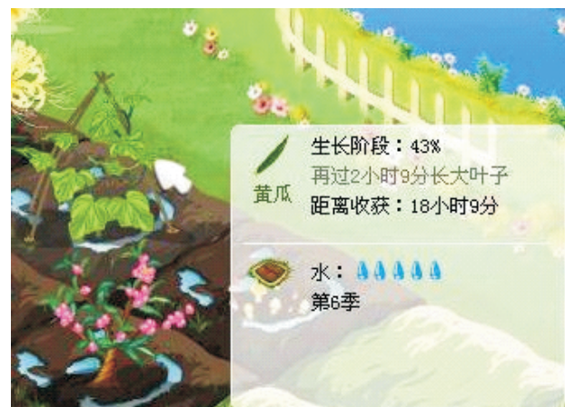
Figure 2. The growing stage of the cucumber plant.