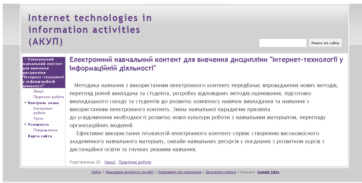
Figure: 4 A site of study of course of "Internet technology is in informative activity"

Familiarizing with electronic educational resources is possible on a site the Resource-based learning: methodical portal of http://rbl3.webnode.com.ua (Figure: 5).