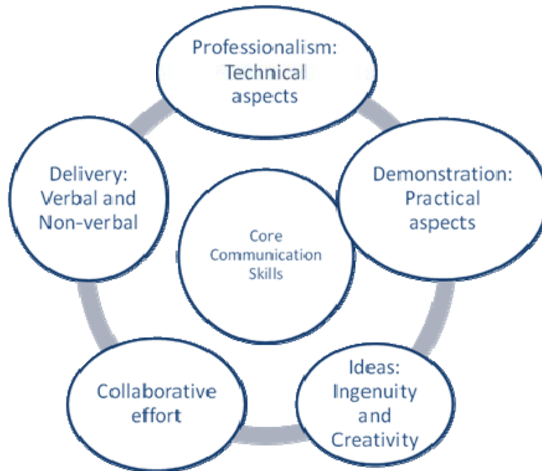
Figure 1. A Schematic Representation of the Oral Presentation Competence in Professional Contexts

Figure 1 provides a schematic representation of the way OP competence is viewed in this project.