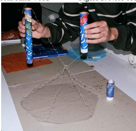
Figure 4. The hexagonal parachute

After deciding on the design and providing the basic argumentations, the next phase was constructing the model rocket. The groups constructed their own model rockets by assuring all the pieces on their own, except the machine. They built the pieces from different materials. The Figure 2, Figure 3 and Figure 4 show some of the pieces constructed by pre-service teachers. The two little fins were constructed from balsa wood and the nose of the model rocket was constructed by rubbing Styrofoam. The hexagonal parachute designed for bringing back the model rocket in safe was constructed from carry-bag and dental floss as seen in Figure 4. Pre-service teachers worked together as a team while building the pieces. After constructing all the pieces, they combined them to construct the model rocket.