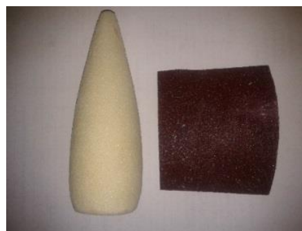
Figure 3. Nose obtained by rubbing of styrofoam