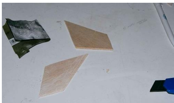
Figure 2. Fins constructed from balsa wood

asked to discuss about the influence of air resistance on their model. During these discussions, the mathematical formulas, such as F_s = \frac{1}{2} \rho \cdot Cd \cdot A \cdot v^2 were discussed.