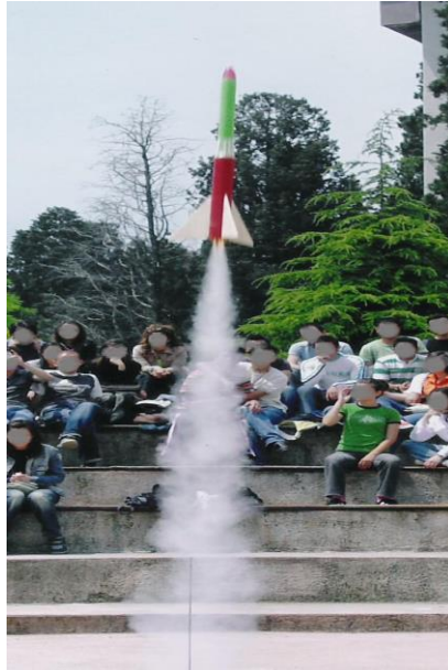
Figure 5. Launching a model rocket

analyzing the data, they could also benefit from computer programs such as MS Excel. Moreover, such kind of projects can contribute students in developing teamwork, communication and many other social skills as discussed in STEM education.