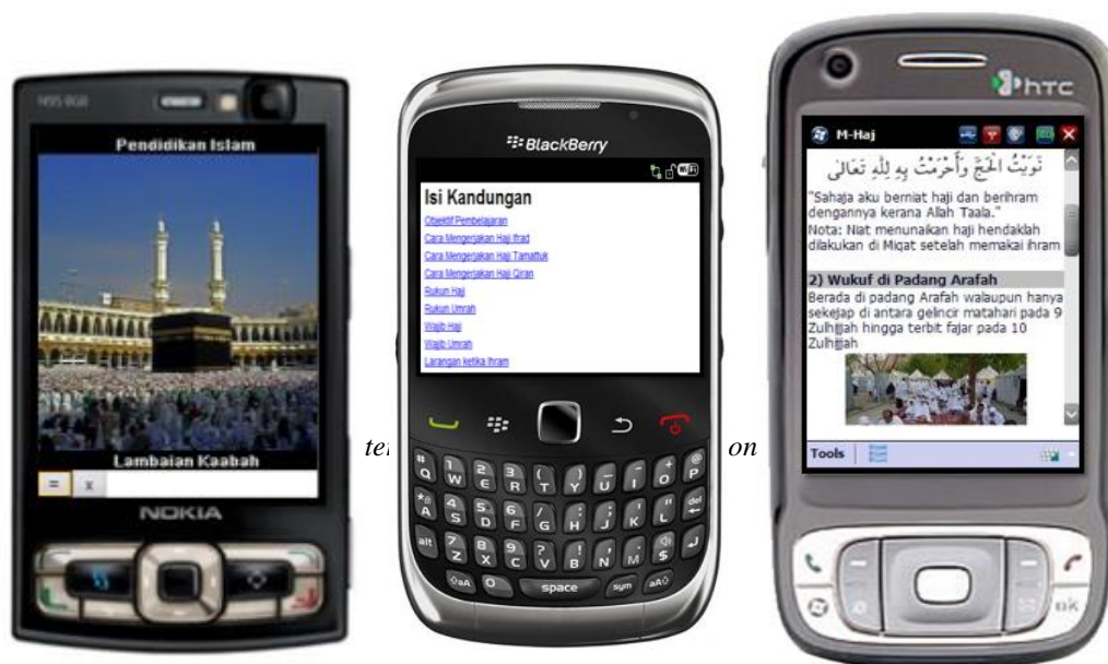
Figure 1 below shows the results of the mobile technology application design that has been developed. This mobile technology application was developed using the Learning Mobile Author version 4, which can be downloaded for free on the website. The mobile phones that support this mobile technology application for teachers includes Blackberry, Nokia, Samsung, HTC and mobile phones with Java ME 2.0 software. The design and development of mobile technology application were based on the ADDIE instructional model because it is suitable to any kind of learning.