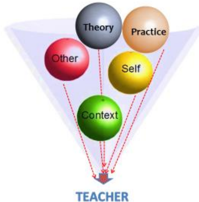
Figure 3: The final stage in lecture 8

When compared to the second stage, the final slide of the TFF shows theory and practice situated exclusively within the boundaries of the funnel. This more focused and contained portrayal suggests that all theory and all practice known to the individual contribute to the process of teacher change and identity formation. This portrayal of theory-practice suggests the need for on-going professional education and development during the constant evolution of one’s identity as teacher.