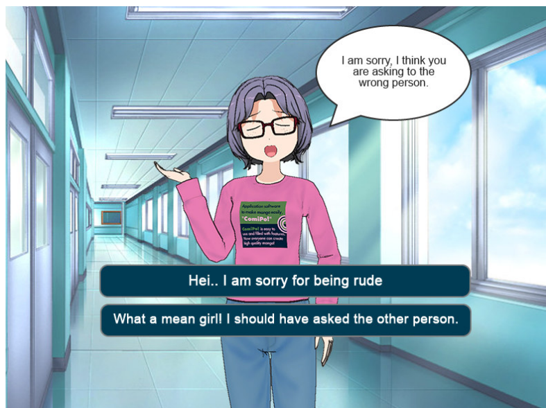
Figure 4.5 Conversation sample