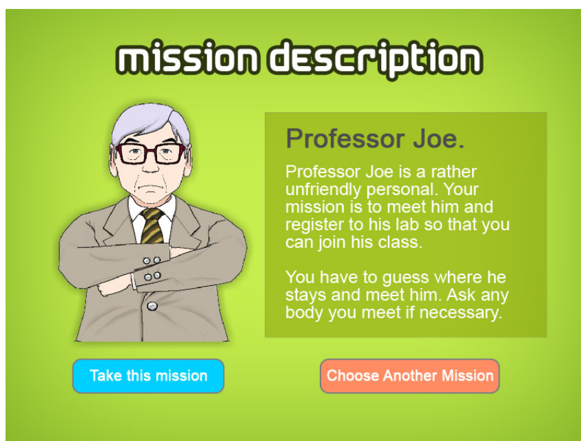
Figure 4.4 Mission Detail

This page is an explanation of the mission taken, namely Meet Professor Joe. The page is described about who Professor Joe so that he may be known, and how to meet him.