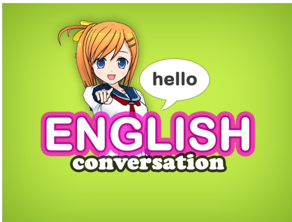
Figure 4.1 Start Page

Visual novel game English conversation begins with the Start page containing the game logo and the start button to enter further into the visual novel game conversation this English language.