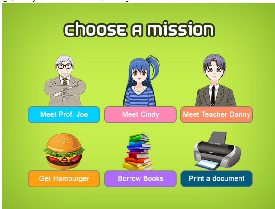
Figure 4.3 Mission Page

This page presents the main missions to be carried out in a visual novel game of English conversation. At this early stage, it only serves one mission, namely Meet Professor Joe.