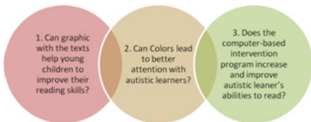
Figure 1. Relationship of the impact of graphic, color and computer programs to reading skills of autism students.

The findings provide answers of the research questions which were mentioned the evidences emphasis on multimedia elements graphic with text and colors are positive improving autism learners in reading.[1]There is a significant relationship between graphic with the text and ASD students learning result [2]There is a significant relationship between computer base program intervention increase and improve autistic learner’s ability.[3]There is a significant relationship between colors effect and autism learner’s attention. All the articles and studies referred to the effectiveness of multimedia elements graphic with texts and some colors with autism children reading comprehension.