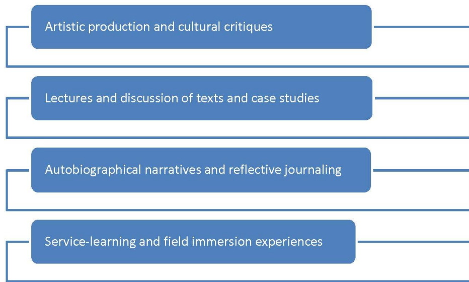
Figure 2. Pedagogic strategies for critical teacher education in and through the arts.

The third approach emphasizes narrative. Pedagogic uses of narratives take many forms, including such activities as reading poems, memoirs, and fiction; viewing and responding to narratively structured images, exhibitions, plays, films, and documentaries; listening to audio archives and personal testimonies; and telling one's own story (Bell, 2010; Florio-Ruane, 2001). Stories can function as a viewfinder of sorts, helping learners to perceive "the other," and consequently the self, through a different frame. 2