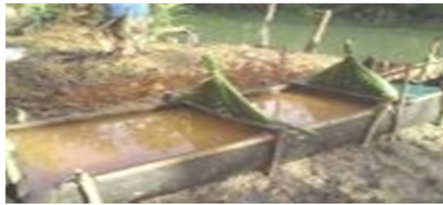
Place of Making Sago