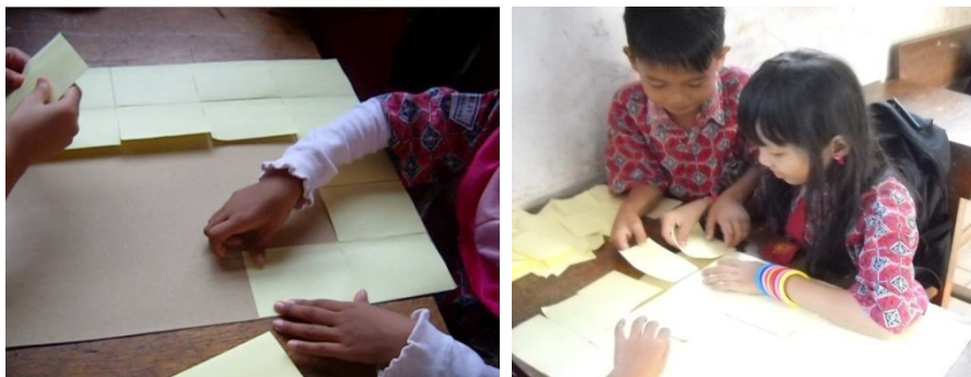
Figure 2. Students cover the baking tray

In the third activity, the students had to compare baking trays that can be put more cookies. It is expected that they can use the unit to compare. In this lesson, students are able to use their own unit to cover the shape in comparing the area. They can partition the region and structure the units into arrays. However, some students choose unit that physically resemble with the region they were covering. They used different units for different baking tray. In this manner, they only focus on the process of repeatedly using a unit and it seems they did not use the unit to compare. It might be because the question is which baking tray that can be put more cookies. Therefore, they did not pay attention to the size of baking tray. The question should be which baking tray is bigger so that they can think how to compare by using same kind of units. Some students were not aware of gaps and overlap in covering. They ignore the leftover paper and count all units include the leftover parts as area. In this level, these students did not get what is the area since they only focus on counting the unit. Students' work is in the following figures.