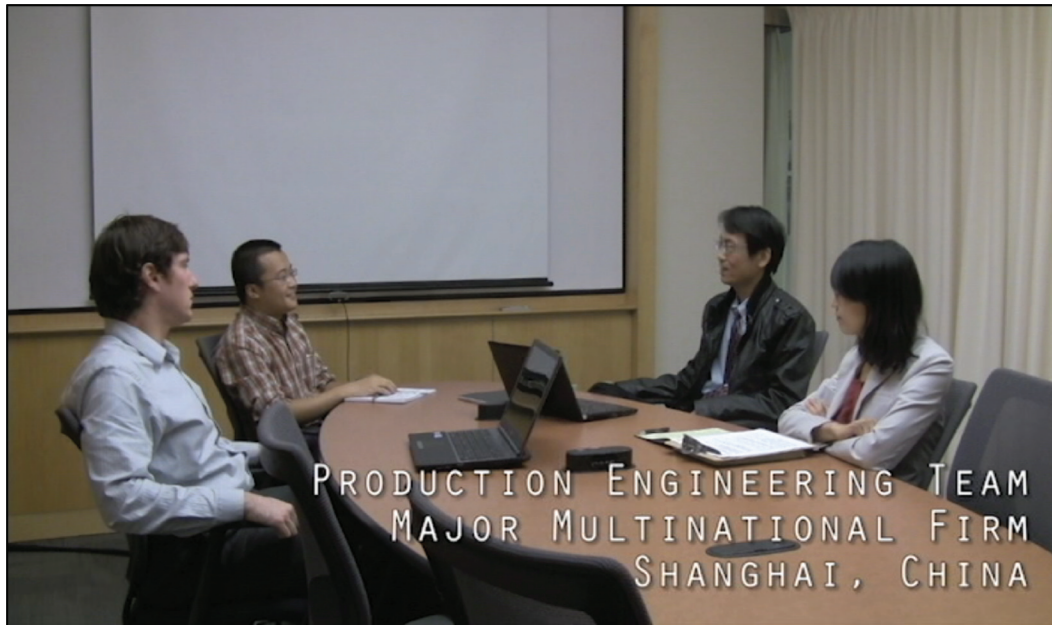
Figure 3. Screen Capture from Global Engineering Competency Vignette #1 (Jesiek, 2013).

Video link: https://www.youtube.com/watch?v=K5mA7yb14Gg&index=2&list=PL84VcUp5xaBsRutUS-8KR2lwFxfh8KfI9G