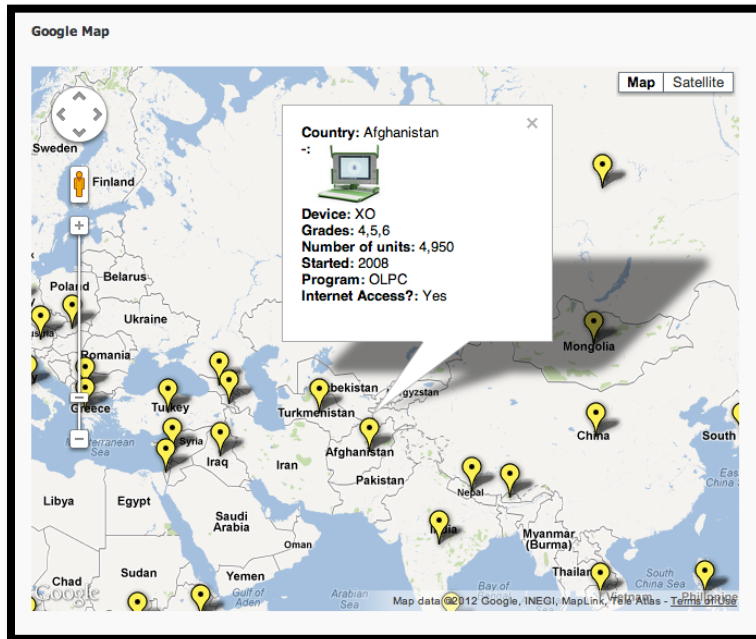
Figure 4. Interactive Google Map of the database