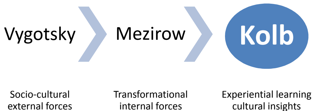
Figure 1: Theoretical Foundation for Study Design

Professional learning requires the complex task of transforming acquired knowledge into applied knowledge. To better understand how the participants in this study were making this transformation a theoretical model of learning was developed to better understand the cross-cultural experience. As shown in Figure 1, the model drew upon the experiential learning theory (ELT) (Kolb, 1984) and was supported by the foundational work of Mezirow (1981, 1991, 1994) and Vygotsky (1930-1934/1978).