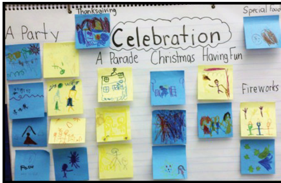
Figure 1: Brainstorming meanings with students

such as Christmas and Thanksgiving. Several students drew images of Mardi Gras and parades, which are particularly interesting since these students live in the New Orleans area, and the vocabulary activity occurred during Mardi Gras season. A few others drew and named fireworks as a part of a celebration. The students and teacher grouped the words by similar characteristic and meanings. Drawing from the knowledge base of the child while building a definition together allows teachers to incorporate the child's cultural background in the meaning-making process. When students have opportunities to interact with their teachers and the text, vocabulary instruction is more meaningful and beneficial (Christ & Wang, 2010; Copple & Bredekemp, 2009; Coyne, McCoach, & Kapp, 2007).