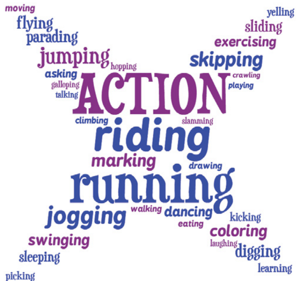
Figure 3: Word Cloud using Tagul

Following a read-aloud, teachers find success with reinforcing vocabulary words using Word Maps (Jones, 2007; Newton, Padak & Rasinski, 2008). After an interactive read-aloud, students brainstormed numerous meanings for the word action as their teacher typed their responses into a Word Cloud using the website Tagul.com, as displayed in Figure 3.