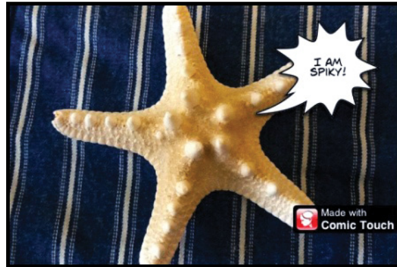
Figure 4: Student generated slide using Comic Touch

for vocabulary development include literacy stations, learning centers, free choice time, outdoor play in the playground, lunch and snack times, circle time, or at any time of the day where children have opportunity to interact with others. Interactions such as these grant teachers many avenues to meet the CCSS for vocabulary development in developmentally appropriate ways (Copple & Bredekemp, 2009).