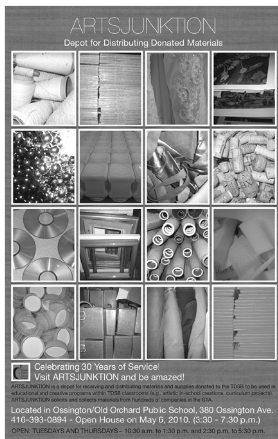
Figure 1. Artsjunktion 30 year anniversary poster.