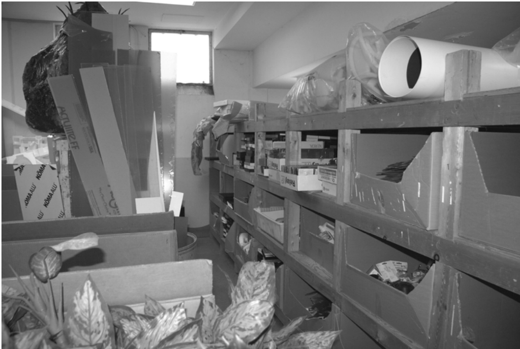
Figure 4. A variety of materials are constantly replenished every week.

companies that donated stuff, but Eileen was ready to expand and improve on this network of suppliers. “You’ve got to hustle your butt to get stuff in here—”, she says, “you really do.” Eileen’s little black book now holds hundreds of contacts from the relationships built over the last 18 years. During our interview Eileen made it clear that these community relationships were absolutely key in sustaining growth. “Twice a year I send out 80 to 100 cards—I make cards, that’s my thing.” These personalized cards include notes thanking the donors for whatever items were given and, if possible, notes and pictures about what the teachers and students did with the materials. “And then I just say, you know, it’s really appreciated by our teachers and students, wishing you all the best for the New Year. I don’t ask for more stuff, and my intention is never to get more stuff—it’s just to keep that connection.” Suppliers for the Artsjunktion include the Art Gallery of Ontario (AGO), picture frame shops, the Liquor Control Board of Ontario (LCBO), movie prop companies, plumbing supply companies, H&M, private donations, and even professional organizers, who drop off stuff from their clients. Eileen encourages teachers to send her pictures of student work created with Artsjunktion supplies. “If they send me a picture of materials that they’ve used, and I know, I can tell which company it’s from—then I forward the email on to the company; they really appreciate that.”