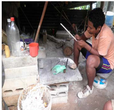
Figure 4: An Orang Asli man making a blowpipe.

Stacks of wood could be seen near the kitchen and the stove was made of bricks arranged in a triangle shape. Tapioca and rice were the staple food for the people. They also depend a lot on hunting for food. During one of the trips to the village, a group of men were seen busy at work. They were preparing the blowpipe and the quivers. When enquired, the men described how the blowpipe was made and how it was important for their hunting. Figure 4 is the scene where one of the men was making the blowpipe.