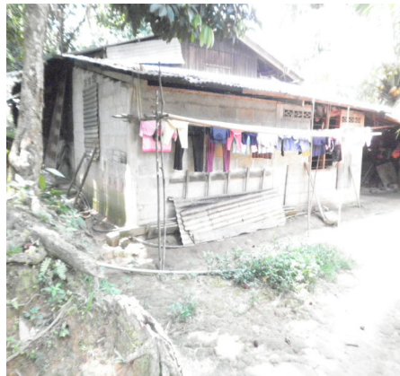
Figure 3: An Orang Asli house in the village.

Most of the students in the school were from the village nearby. It was a small village with mostly wooden houses. The houses were very close to each other and most were similar in structure. Most obvious was the kitchen section of the houses; these were built separately and could be viewed from outside. Figure 3 is an example of the house observed in the context of the study.