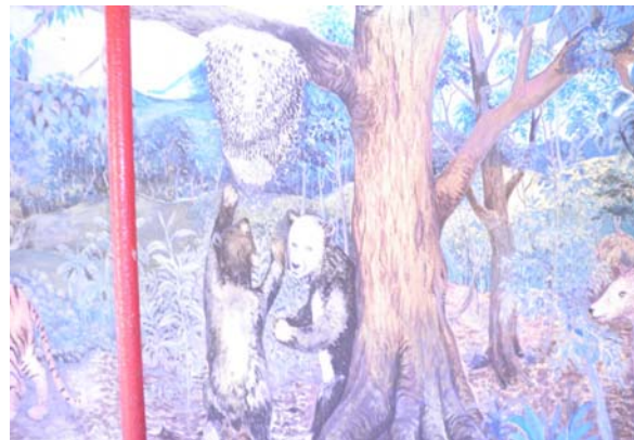
Figure 2: One of the murals in the school.

A close look at the buildings revealed that the school paid a lot of attention to the Orang Asli culture and the students’ interest. The mural paintings in most of the school buildings were based on nature and environment. Images of animals such as elephants and tigers were painted on the classroom walls. Small fish ponds and man-made waterfalls were also built between the classrooms. Figure 2 is an example of mural painting on the school wall.