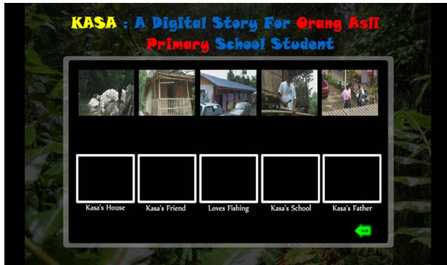
Figure 7: Screen shot of a drag-and-drop activity in the module.