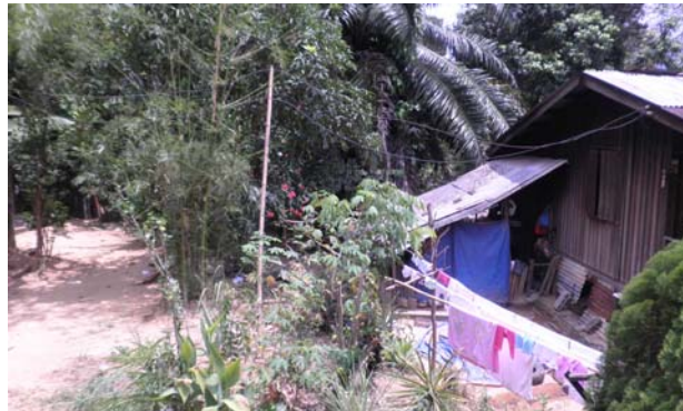
Figure 5: The village surroundings.

The village was surrounded by bamboo and rubber trees. There was also thick jungle behind some of the houses. Apart from hunting, the people also collect bamboo and rubber to be sold. Figure 5 is the scene of the surroundings of the village.