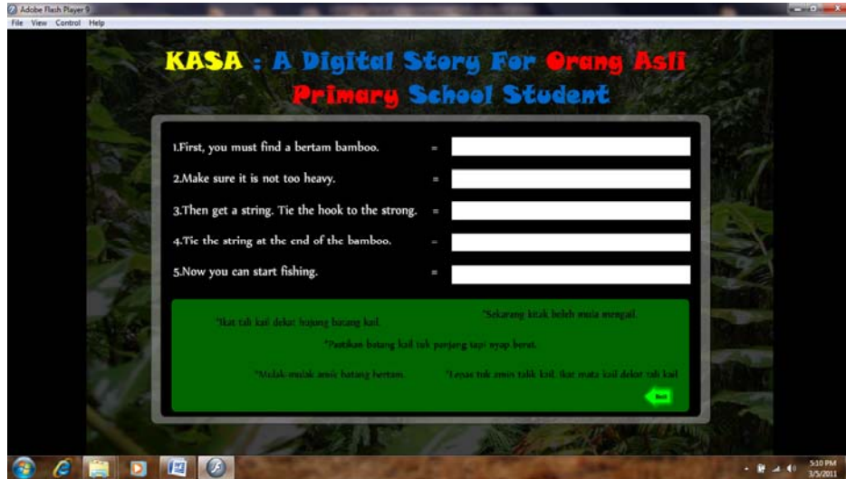
Figure 6: Screen shot of instructions for creating a bamboo fishing rod.