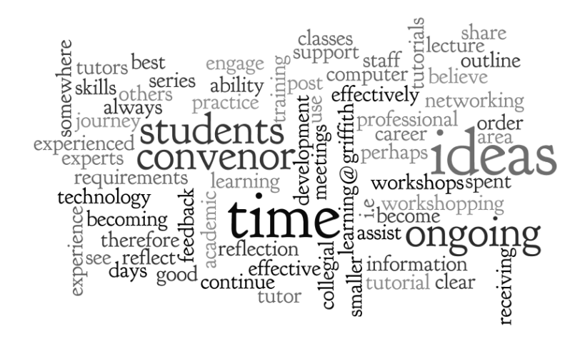
Figure 3: Resources required to build the capacity of sessional teaching staff

When respondents were asked: What would assist you to become a more effective teacher? a number of ideas including having meetings with the course convenor and gaining feedback from course convenor during the semester that could be classified under the broader theme of 'collaboration and collegial support' were listed. Figure 3 reports on the results of the question: The area/s I need to further develop is/are. Responses to this suggest that respondents required more time to collaborate and develop technological skills to improve their effectiveness as a teacher. Skills in the use of technology, were deemed necessary to network academic staff and communicate with students. Respondents saw technology as a conduit for effective collaboration and for sustained collegial support. Yet other data clearly indicated that lack of time and outside employment (17 respondents indicated that they currently have other paid employment outside of their university work) adversely impacted the opportunity for building such capacity.