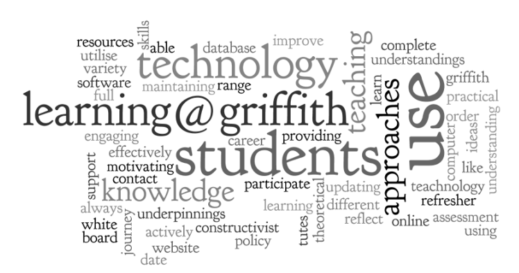
Figure 2: Qualities of the sessional teaching staff

The following two items related to qualities that sessional teachers perceived were necessary for effective teaching. Respondents were asked to respond to: Please list the qualities that you believe university students want in sessional teaching staff , and Please list the qualities that you believe effective sessional teaching staff should demonstrate . These qualities discussed in what follows have been extrapolated from the content cloud represented in Figure 2.