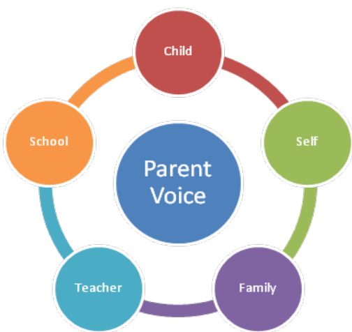
Figure 1: Parent Voice Model

cultural norms for their children through their approaches to parenting and their casual interactions with their children.