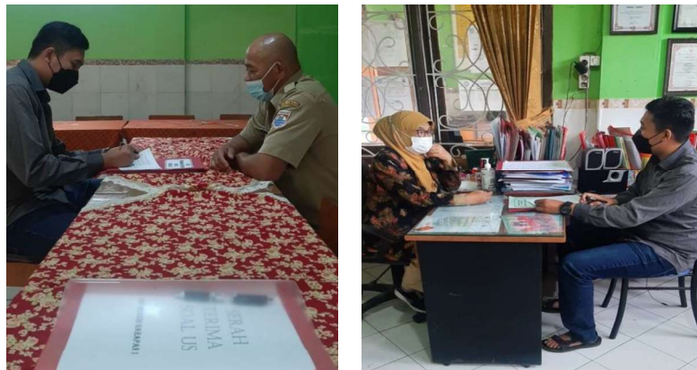
Figure 1. Interview Activities with School Supervisors and Principals

The input (antecedent) aspect is focused on two components which include planning for the implementation of the beginning teacher induction program and preparation for implementing PIGP. In the PIGP planning the supervisor makes the plan by including the program in the supervision program related to the implementation of PIGP and the supervisor records the newly appointed teachers. The supervisor then held a coordination meeting with the education office regarding the mechanism for implementing outreach to beginning teachers. The school principal follows up on the guidance supervisor's submission by calling beginning teachers and appointing supervisors who will assist beginning teachers in implementing PIGP. Planning was not carried out properly because the schedule clashed with the basic training program for civil servants. Furthermore, beginning teacher mentors were taken from senior teachers from other elementary schools due to the absence of senior teachers who were ready to become mentors. This resulted in the PIGP planning meeting not being held with the school principal.