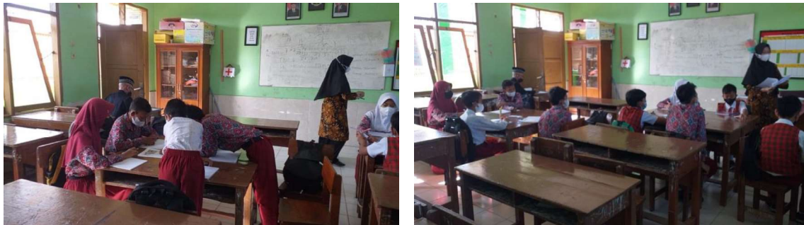
Figure 3. Observation of Learning Implementation Activities

Based on the table above regarding the criteria for the dimensions of outcomes in the aspect of the teacher's ability to plan to learn, a score of 20 is obtained and converted to a scale of 100, and a score of 83.3 is obtained. So it can be concluded that the ability of teachers to plan lessons that have participated in PIGP at Harapan 1 public elementary school is in a good category.