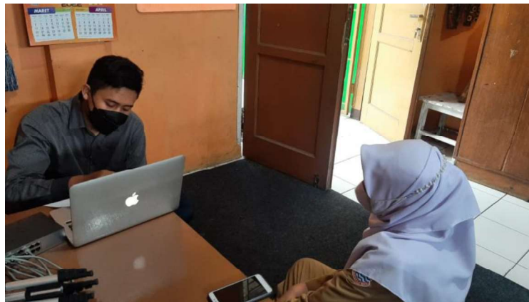
Figure 2. Interview Activities with Mentor

The process (transaction) aspect, namely the implementation of PIGP at Harapan 1 public elementary school includes three components, namely mentoring the implementation of PIGP, evaluating the implementation of PIGP, and reporting on the implementation of PIGP. Based on the guidance guide carried out by the supervisor only for the mentor and further guidance it is the mentor who guides the beginning teacher during the mentoring stage for 1 year, however, the supervisor does not carry out the guidance for the mentor. Supervisors carry out guidance to beginning teachers once. While the principal is only limited to coaching and mentoring beginning teachers, they are handed over to the supervisor's responsibility. At the guidance stage, the mentor has an important role.