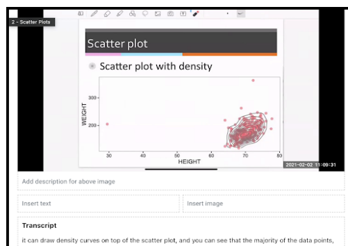
Figure 2: The digital book chapter editing interface