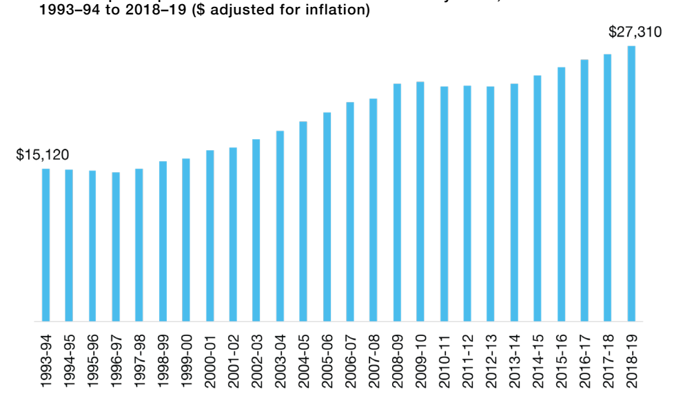
Figure 2 Revenue per Pupil for New York State Public School Systems,

Source for figures 1 and 2: Author's calculations based on data from NYSDOE and U.S. Census Bureau