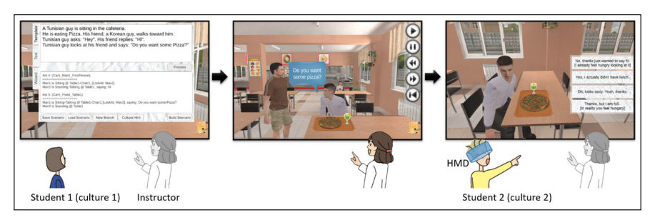
Figure 1. Scenario creation (left), system output (middle), and role-play (right) using situation creation toolkit