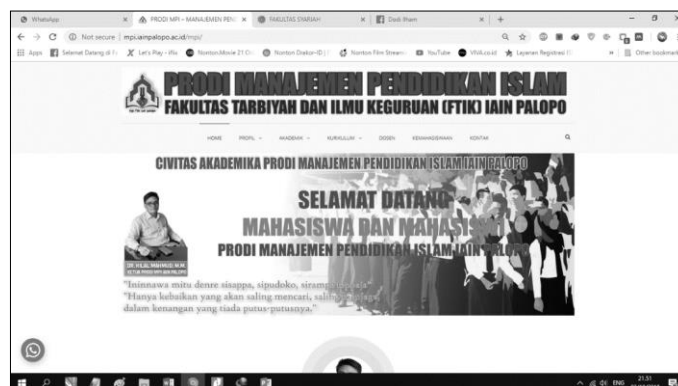
Figure 5. Web display design of Islamic Education Management Study Program