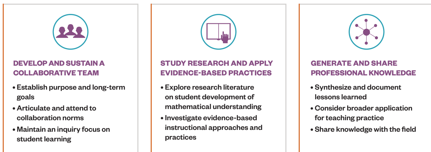
Figure 2. Implementation Practices

developing and abiding by team collaboration norms, and maintaining an inquiry focus on student learning (rather than faculty evaluation) throughout the process. The second is to study research and apply evidence-based practices . Without this emphasis, LS participants may design and refine lessons in ways that are counter to the best available evidence on student learning. The focus on research on instruction allows instructors to translate empirical evidence into classroom practice. The third implementation practice is to generate and share professional knowledge . If the time invested in LS is to have long-term benefits, and if LS is to be scaled up to include more faculty, learnings must be made explicit and shared. Observations about the adaptation of LS at the three Oregon community colleges that we share below are focused on these three implementation practices.