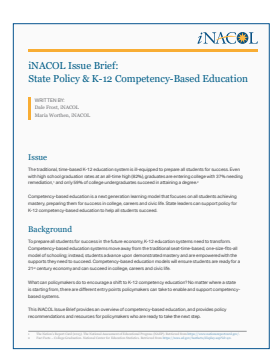
iNACOL – <u>State Policy &</u> <u>K-12 Competency-Based</u> <u>Education</u>