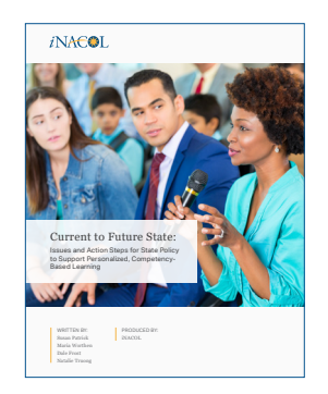
iNACOL – Current to Future State: Issues and Action Steps for State Policy to Support Personalized. Competency-Based Learning