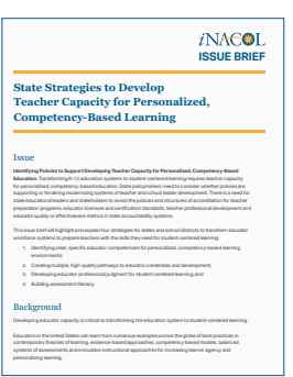
iNACOL – State Strategies to Develop Teacher Capacity for Personalized, Competency-Based Learning