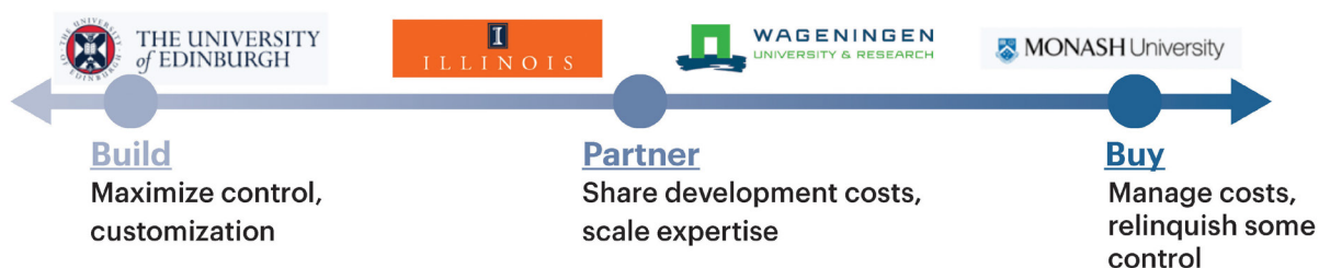
FIGURE 2. STRATEGIC SOURCING OF RDM CAPACITY IN FOUR CASE STUDY UNIVERSITIES