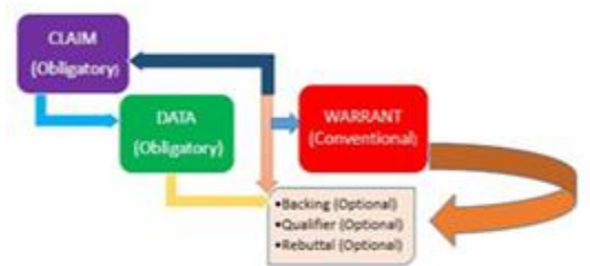
Figure 4: The Structure of Strong Argument Structure

From the example above, claim and data are used as the element of the argument. Claim is shown from the presence of the sentence "education has a complementary role to play" the author attempt to convey the claim of fact proven by the following data after the claim. It consists of telling details shown by the words "firstly, secondly" and example shown by the words "for instance". This structure is indicated as the simplest structure where the author only put a claim and relevant justification regarding to the topic given.