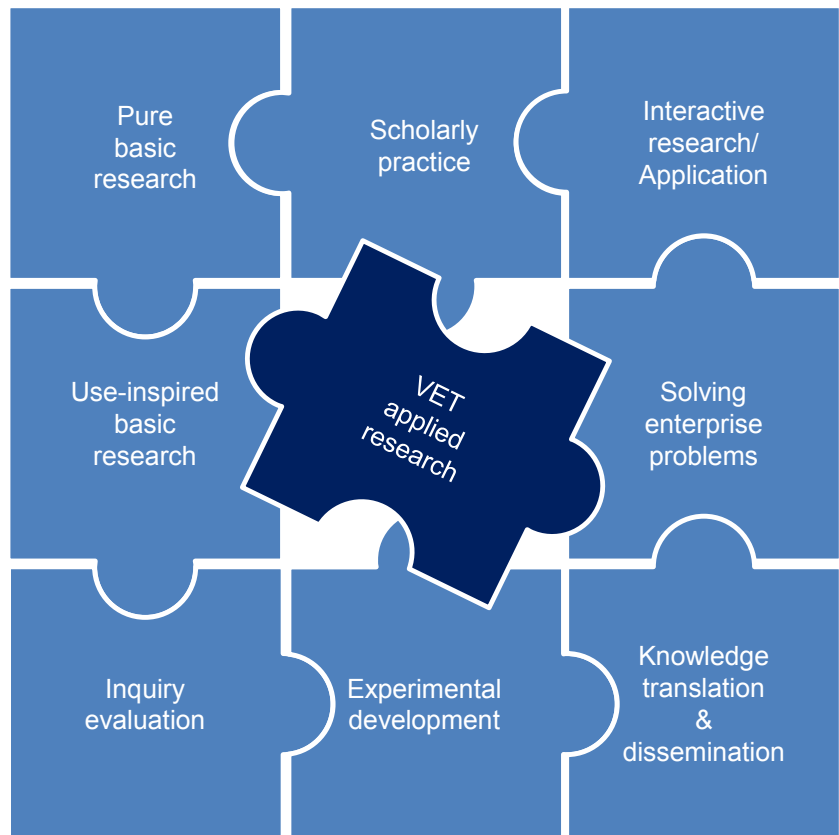
Figure 1 VET applied research: a missing piece in the innovation system

The framework described here has a specific application to the VET sector, in that it draws on the skills and capabilities identified by participants in this research project – VET professionals, researchers, policy advisors and industry representatives – and on the skills identified in VET training packages. Examples of where applied research is practised in the VET system are presented in the boxes below.