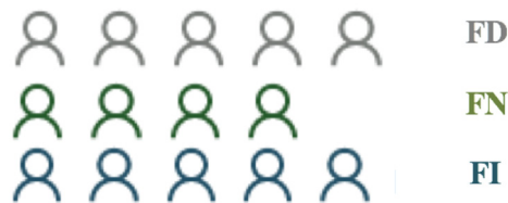
Figure 2. Classification and distribution of subjects according to the FDI dimension (N=14)

The dataset that consisted of students' learning strategies (see section 2.3.2) was imported into the NVivo qualitative data analysis software version 11. Students' responses were clustered into codes by virtue of thematic coding. The iterative coding approach and the subsequent code saturation elicited a total of 4 main thematic topics which were classified under the four given learning tasks. Figure 3 reflects the thematic categorization of students' learning strategies.