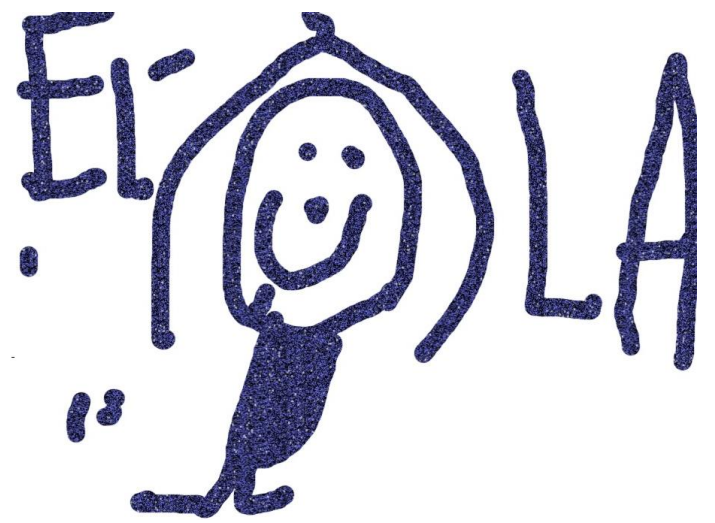
Figure 1. An example of writing using Doodle Buddy

Using the keyboard to form writing. Some children could form letters using their finger on the screen and others were not yet able to write letters. However, all the children were able to use the on-screen keyboard to write letters, because, even though they could not yet form the letters, they could identify the letter and touch it on the screen. For example students used the Storykit app to write digital books independently. For that activity, Wyatt used the keyboard to type the title of his book, 619, which may initially-seem arbitrary. However, it is the name of a popular wrestler. Kiley used the keyboard to type her name on the cover of her book, as well as her friend Ashley's name who her story was about. Dillon chose to write a book about hunting. He sounded the word out carefully out loud. While he was unable to hear all the sounds in the word, he was able to hear the /h/ sound at the beginning of the word and find the letter h on the keyboard. After he typed the letter and typed it. On the second page of the digital book, Dillon used the keyboard to type random letters. The availability of a keyboard, for what was initially conceived as a drawing activity, prompted students to practice their spelling and pursue further knowledge of spelling and writing. Such interest would likely not have occurred with a paper-based activity of the same variety because the majority of students in the class are unable to form letters by hand.