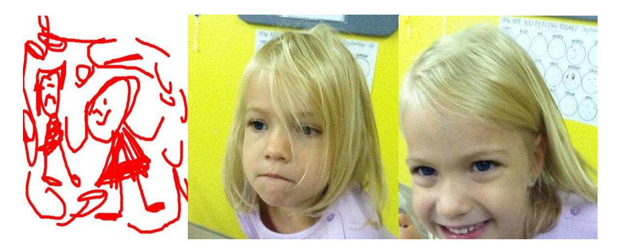
Figure 2. Student sample from Feelings Book