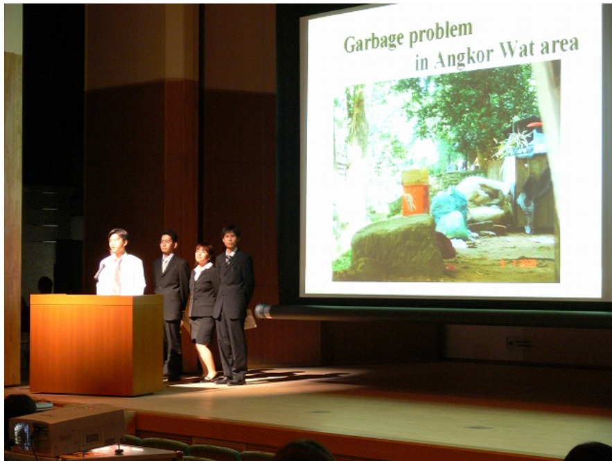
Figure1. Japan and Cambodia Joint Presentation at the World Youth Meeting.