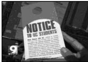
New students receive door hangers in residence halls to remind them of alcohol laws and policies at the University of Northern Colorado.