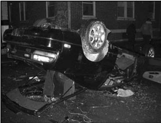
No-parking zones at event locations can reduce the likelihood that cars will be flipped, burned or vandalized such as occurred in Boston after the 2004 World Series.

13. Closing or controlling traffic flow. Police should consider closing certain streets to traffic. This will create more space for pedestrians 57 and prevent cars from passing through the gathering. It will also serve to prevent students from bringing in large signs or other items that they can burn or use as weapons. 58