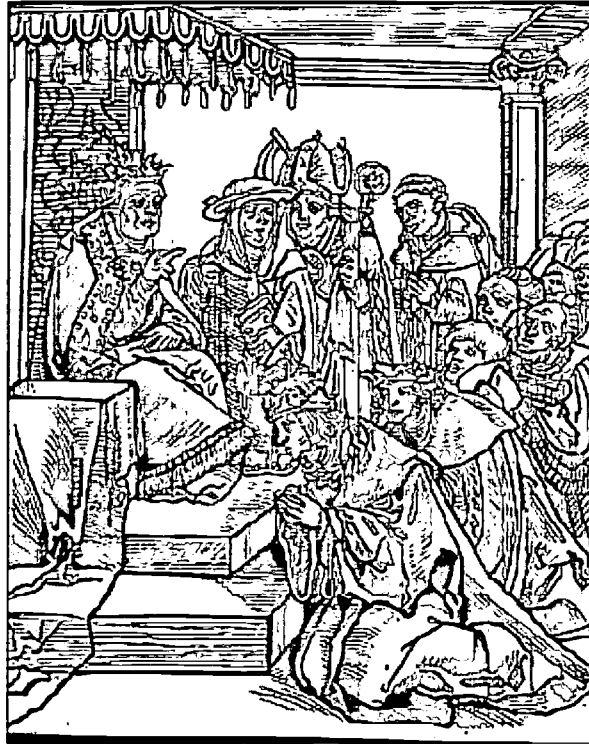
Kissing the Feet of the Pope