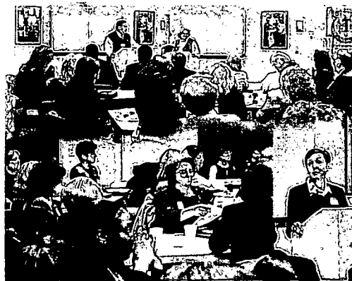
Employers talk about child care at breakfast roundtables

Opportunities may also be available in association with an initiative sponsored by the National Governors' Association to build public and political support for early care and education programs. Maryland was one of five states selected to participate. As regional public/private partnerships evolve, there may be opportunities to participate in this initiative.