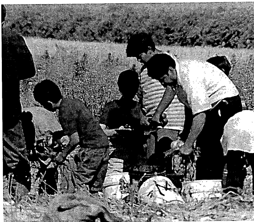
Figure 1: Children as Young as 6 Picking Onions, April 1998