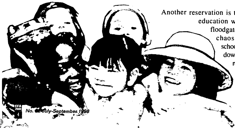
No. 2 July-September 1998