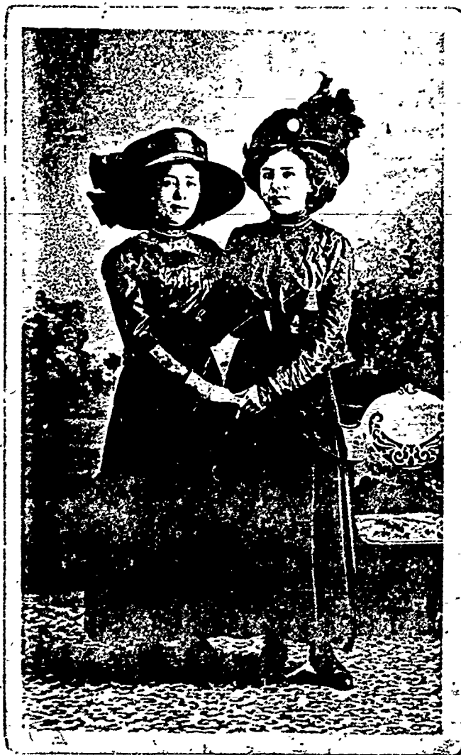
Postcard: Lakota Women