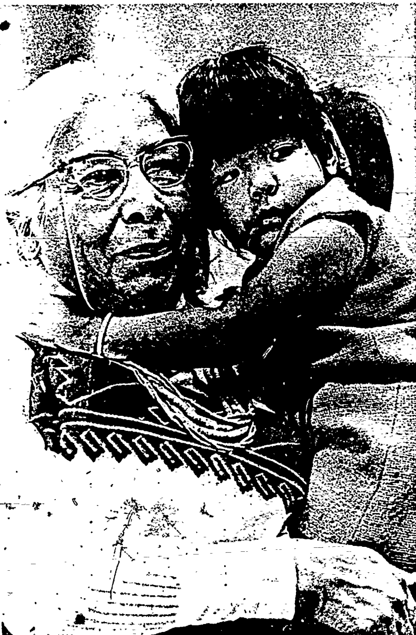
*Photograph by Courtesy of the National Indian Education Association Two Attendees of Fashion Show National Indian Education Association Convention, 1976 Photography by Chris Spotted Eagle