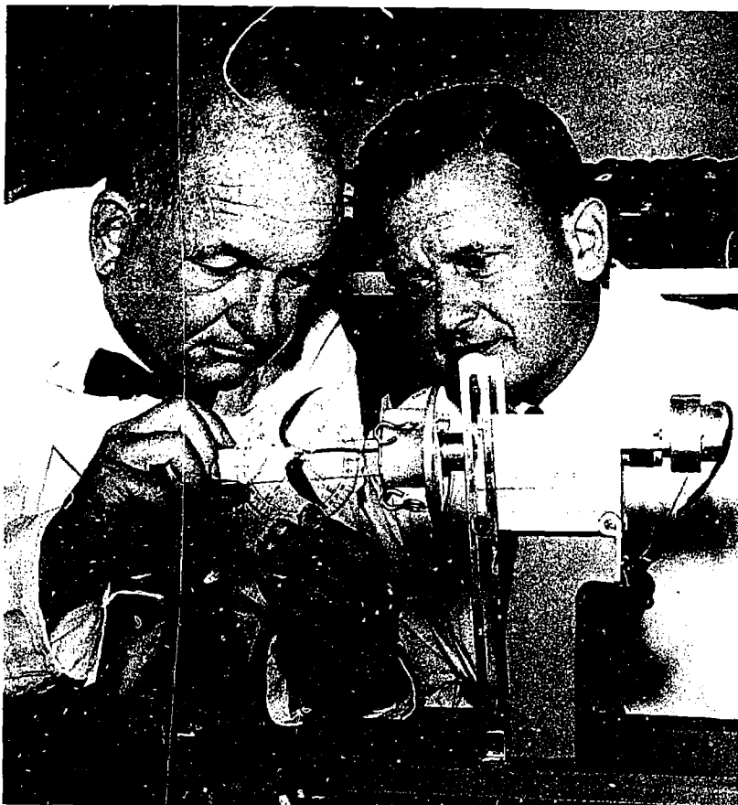
Botanists study leaves of pepper plant to be launched into earth orbit.

natural history museums, zoos, and botanical gardens.