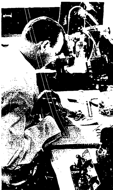
Pathologists usually work in laboratories.

Pathologists study the nature, cause, and development of disease, degeneration, and abnormal functioning in humans, in animals, or in plants. Many specialize in the study of the effects of diseases, parasites, and insect pests on cells, tissues, and organs. Others investigate genetic variations and other abnormal effects caused by drugs. The term "pathologist" is normally reserved for specialists in human pathology (medical pathology). Specialists in animal pathology are usually