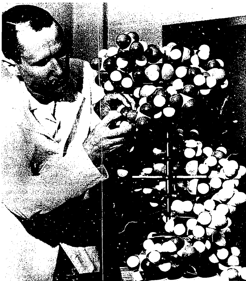
Biochemist constructs molecular model.

About seven out of ten biochemists are engaged in research. The vast majority pursue basic research designed to increase scientific knowledge. The small group of biochemists working in applied research use the discoveries of basic research to solve practical problems or develop useful products. For example, through basic research, biochemists discover how a living organism forms a hormone. This knowledge is put to use by synthesizing the hormone in the laboratory and then producing it on a mass scale to enrich hormone-deficient organisms. The distinction between basic and applied