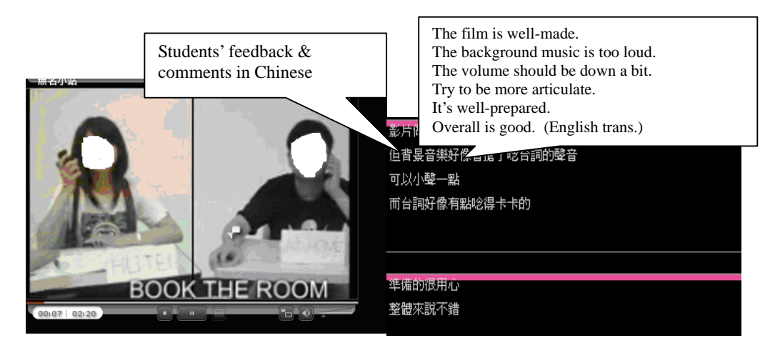
Fig. 1: An example of the students' blog

At the beginning of the class, the 44 students were separated into seven groups. Each one of them was to make a film related to the course subjects and to upload it to his or her blog. The length of the film was limited for less than five minutes. The file size of each film was not to be overly large. Neither the layout nor the pattern of each blog and film was subject to limitations. However, a comment and discussion board was a requirement for each. The blog was to allow upload and download of films, easy access, and easy revision (Figure 1).