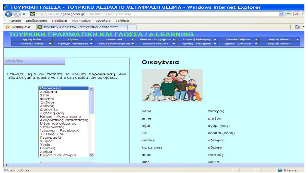
Figure: 4 Learning Turkish vocabulary-The theoretical part

and fill in) were collected for a period of 6 months.